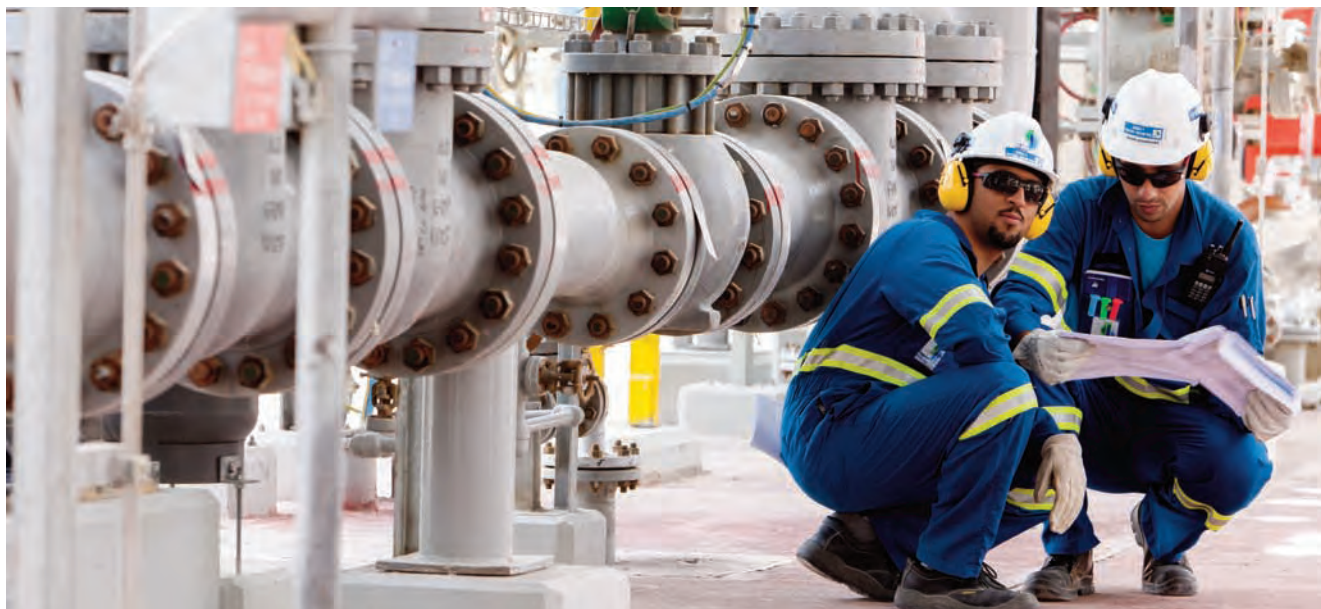
Outside operators at the Satorp refinery in Jubail, Saudi Arabia

The terms "Company" and "issuer" as used in this document only refer to TOTAL S.A., parent company of the Group.