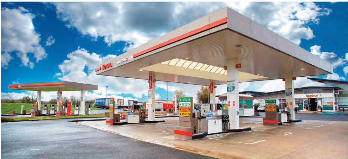
Mille étangs service station, Luant, France

Pursuant to the provisions of Article L. 225-209 of the French Commercial Code, the maximum number of Company shares that may be repurchased under this authorization may not exceed 10% of the total number of outstanding shares of the Company's share capital on the date of the operation. This 10% limit applies to a share capital amount that may, if needed, be adjusted to take into account operations posterior to this Shareholders' Meeting that affect the share capital. Such repurchases may not at any time cause the Company to hold, directly or indirectly through its subsidiaries, more than 10% of its share capital.