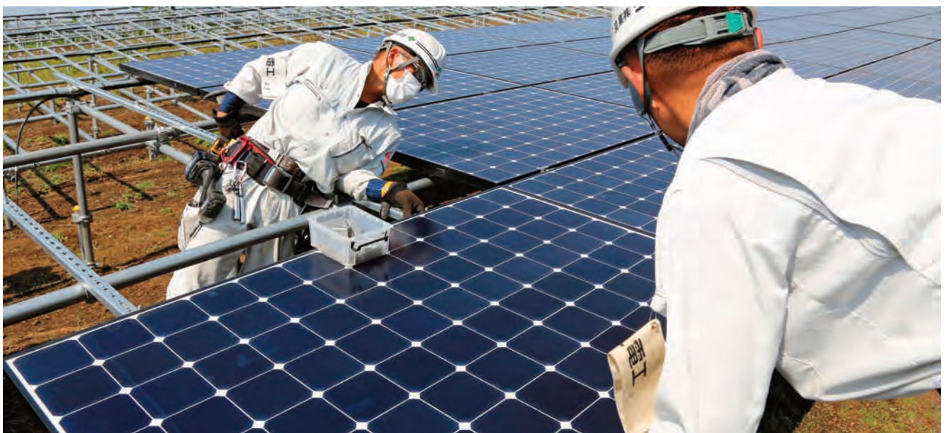
Works for the installation of Sunpower solar panels at Sasyunkan co, Kumamoto, Japan

At the end of this Shareholders' Meeting, the Board of Directors would have twelve members, including one director representing employees and one director representing employee shareholders. The Board of Directors would include four foreign Directors (36.4%, excluding the Director representing employees) and four female Directors (36.4%, excluding the Director representing employees). The Directors of TOTAL S.A. have diversified profiles. They are present, active and involved in the work of the Board of Directors and Committees in which they participate. The complementary nature of their professional experiences and their competencies are assets for the quality of the Board's deliberations within the framework of the decisions that the Board makes.