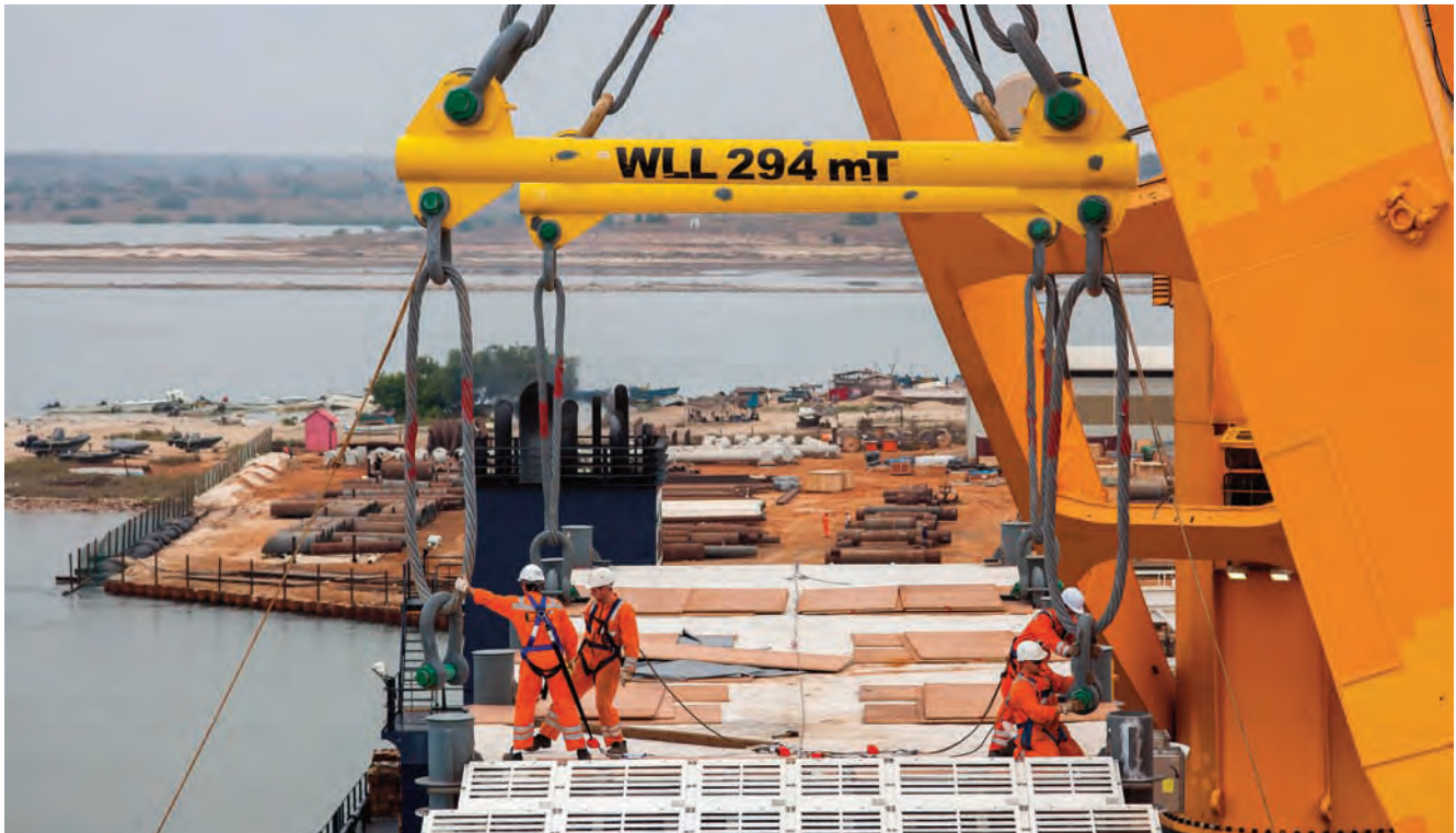
GiRri phase 2 project, Angola

For resolutions that may be added to this meeting agenda following requests for registration by shareholders and/or by the UES Uptstream TOTAL's Workers Group Council, please refer to pages 36 and 37.